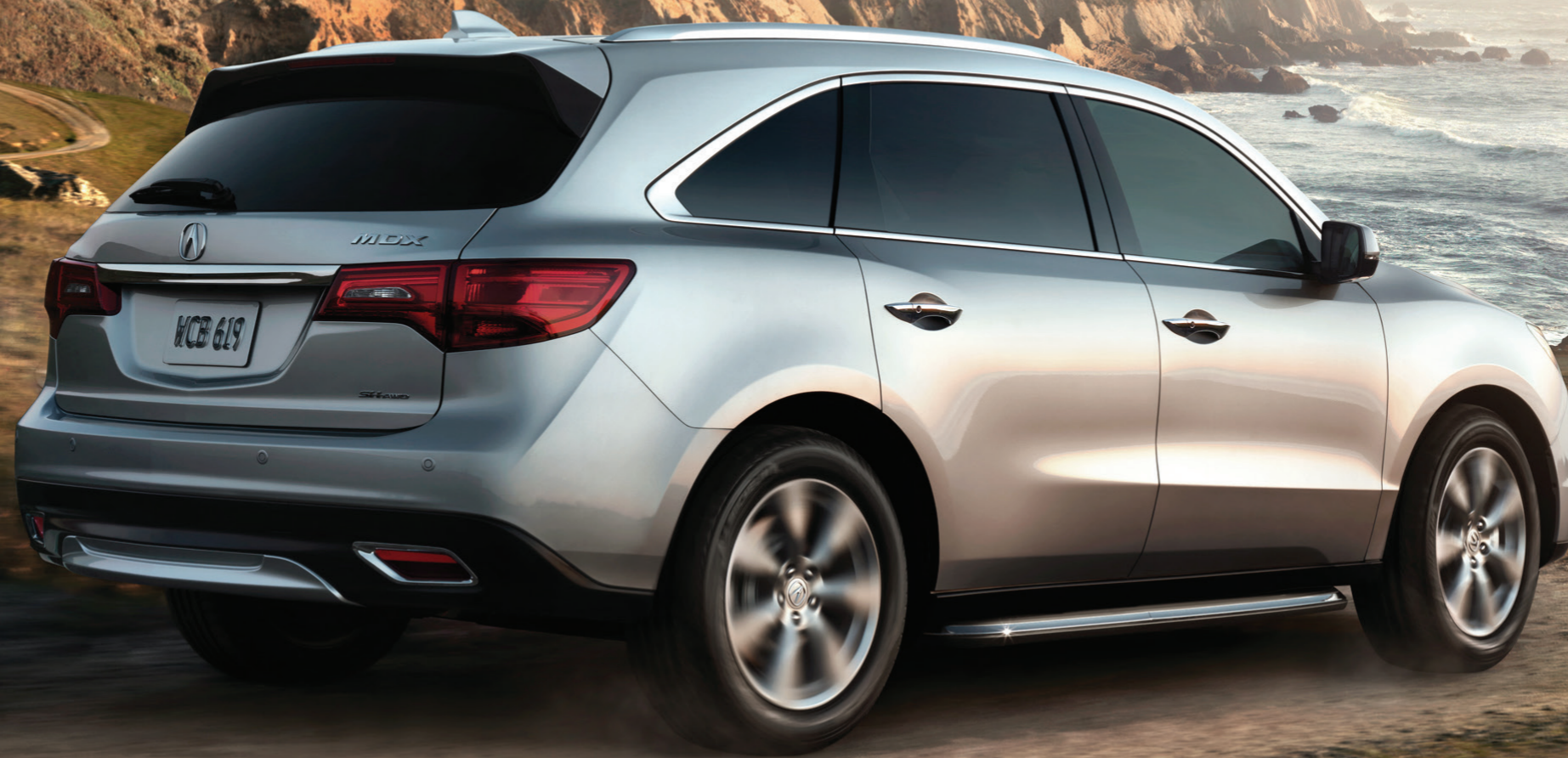
MDX SH-AWD shown with Advance and Entertainment Packages, Accessory Rear Sport Bumper Trim and Advance Running Boards