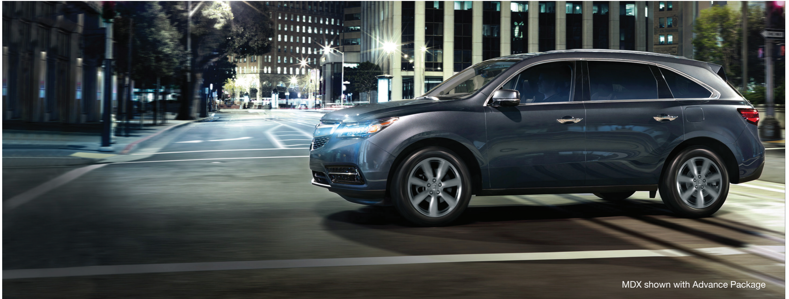
MDX shown with Advance Package