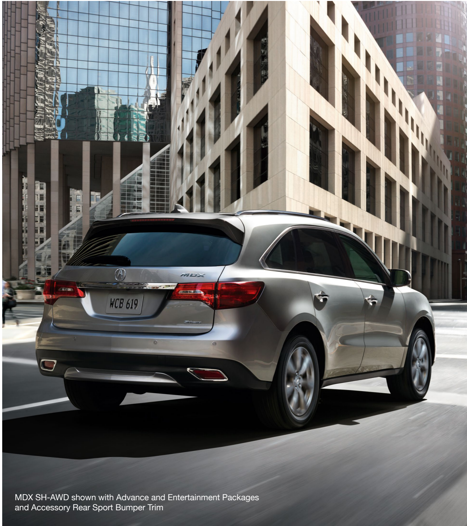
MDX SH-AWD shown with Advance and Entertainment Packages and Accessory Rear Sport Bumper Trim