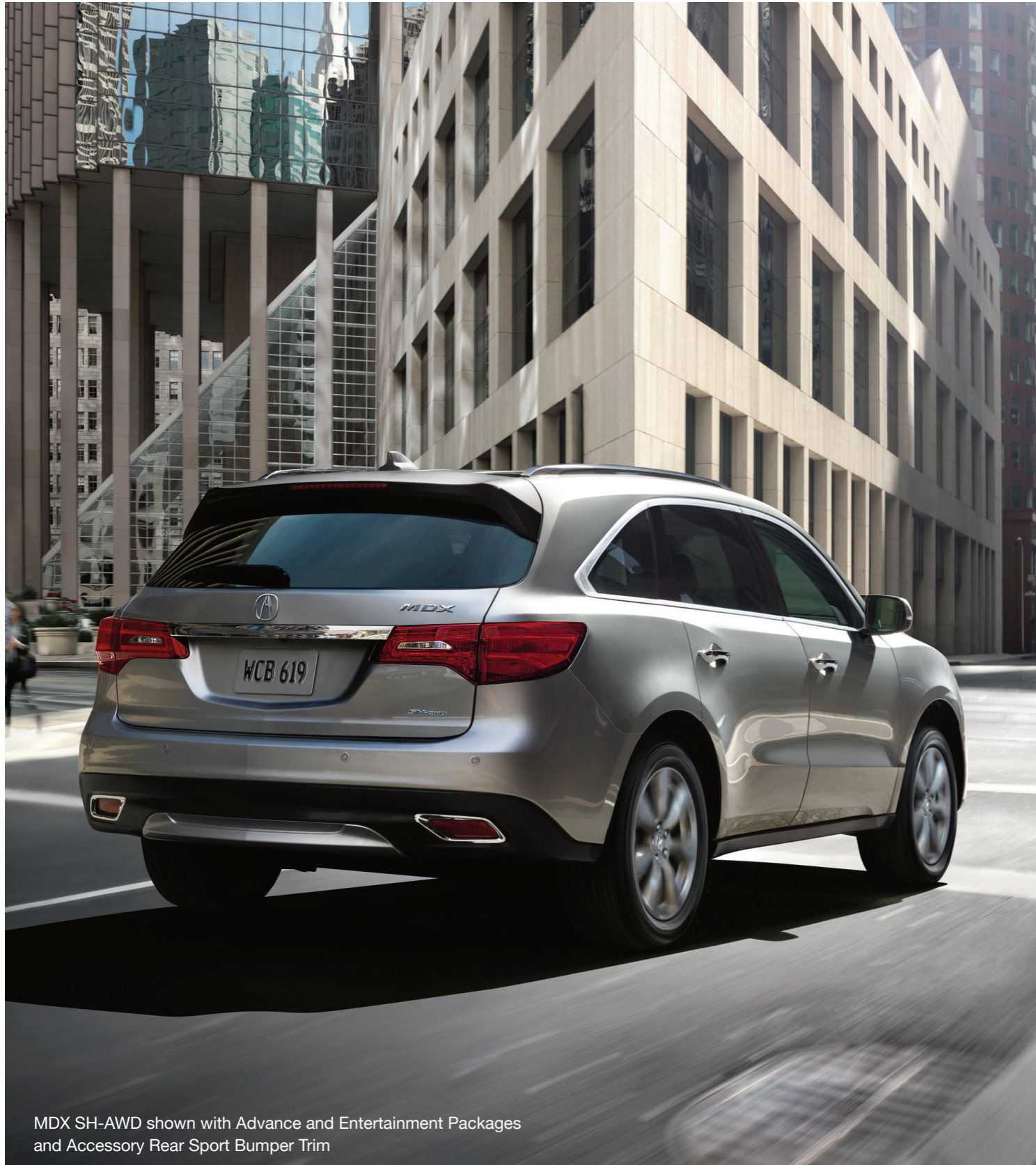
MDX SH-AWD shown with Advance and Entertainment Packages and Accessory Rear Sport Bumper Trim